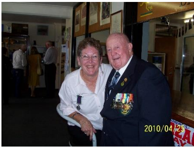
Photos from one of our Veterans' Health week Golf Day